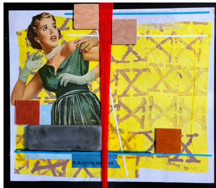
"THE BIG ADVENTURE BOOK FOR MEN"