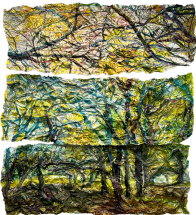
"BARE TREES IV"