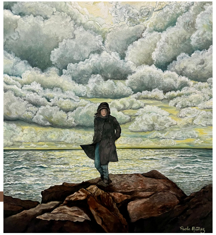
"RAISING THROUGH THE STORM"