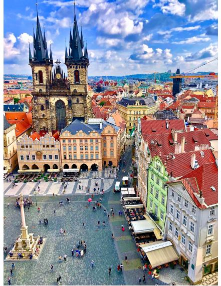
"OLD TOWN PRAGUE"