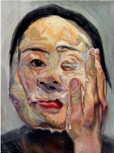
"DOUBLE FACES PRE & POST COSMETIC SURGERY-1"