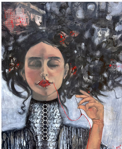
"BE SEEN AND NOT HEARD"